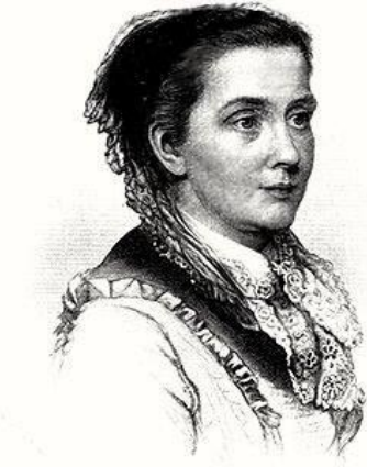
Julia Ward Howe

Mother's Day was originally started after the Civil War, as a protest to the carnage of that war, by women who had lost their sons. Here is the original Mother's Day Proclamation from 1870, followed by a bit of history (or should I say "herstory"):