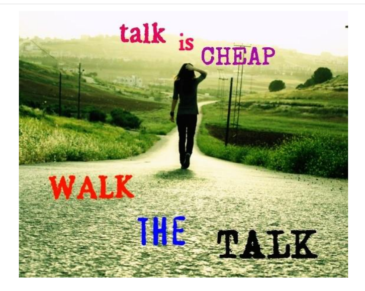
Walking the Talk: Should There Be a No Exception Clause to Our Principles?