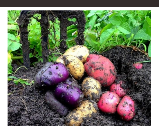
Our Union - by Hafez