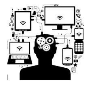
Look for an email, coming soon. All will be explained!